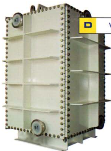
Welded plate heat exchanger HEATEX®